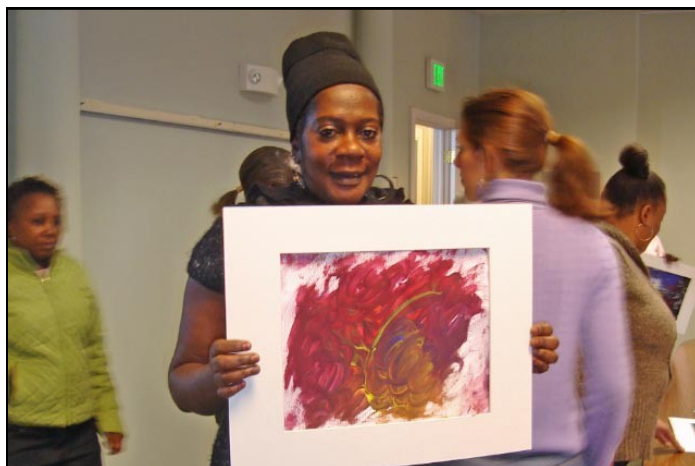
Showing off artwork on retreat in St. Louis.

Several years ago the ISP team in Boston began a new art activity on Saturday afternoon. One of the team volunteers brought a variety of cards, stamps, inks, punches and papers and set them up on several large tables in the meeting room. The women making the retreat were invited to come and see; they could join in as they wished.