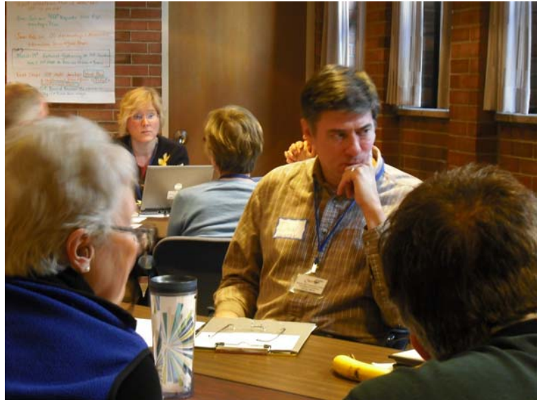
This year’s gathering featured a presentation from the Houston Team.

“One of the best things about the National Gathering,” a coordinator told me, “is the chance to really see just how big ISP is and to take back really good ideas.” As our network continues to grow, we remain committed to providing strong formation for our volunteer team members so they can continue to be present and most prepared to meet our retreatants on their journey within the retreat and after.