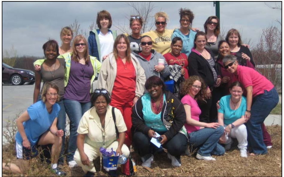
In April the Omaha team held their first women’s retreat. Our network is growing!

Another new team member observed, “The ISP retreat was a blessing for those who gathered. When we first gathered we were strangers to each other. Prayer, shared silence and conversation gave us common ground and connected us in spirit. This was a rich and graced experience” – and I would add, one to which we all hope to return in the coming year!