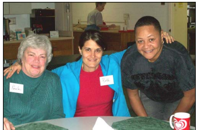
Pittsburgh recently held their first ISP Women's retreat.

One of our new retreat team members said, “I think that my most memorable moment was when one of the women, speaking in response to the lectio on the paralytic said, ‘Yes, it is enough to be forgiven. That is enough for me.’ It seemed like such a powerful testimony and I understood the text in a whole new way... The woman who spoke seemed so free when she said it. I think it was so symbolic of the kind of experience that many have - a real opening up to what God has for them - a receiving of the grace God desires for each of us.”