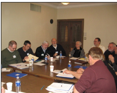
ISP staff, board members, and regional directors gathered in March for a day of collaboration

inspiring. There are times for certain things to appear in the world, and the relative ease with which doors are opening, hurdles are being crossed, and dedicated and talented people are joining this ministry indicate to me