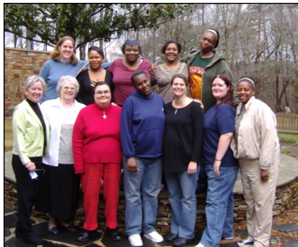
Participants on the first ISP women's retreat in Atlanta in March

During the months of January, February, and March, women's retreats occurred for the first time in Atlanta and Cleveland and the second time since September in Baltimore. These retreats were all part of the expansion process of the Ignatian Spirituality Project.